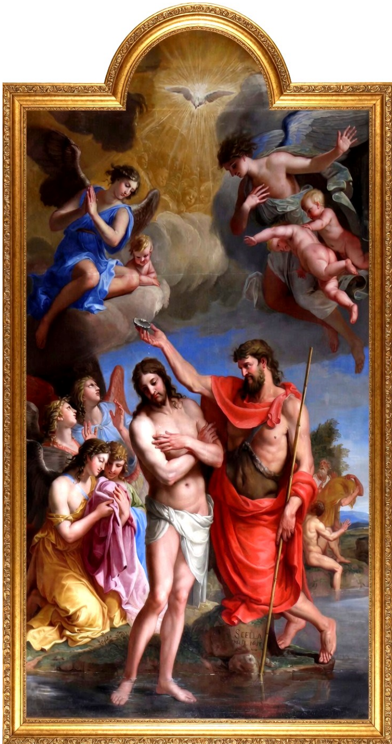
The Baptism of Christ [Le baptême du Christ] by Jacques Stella