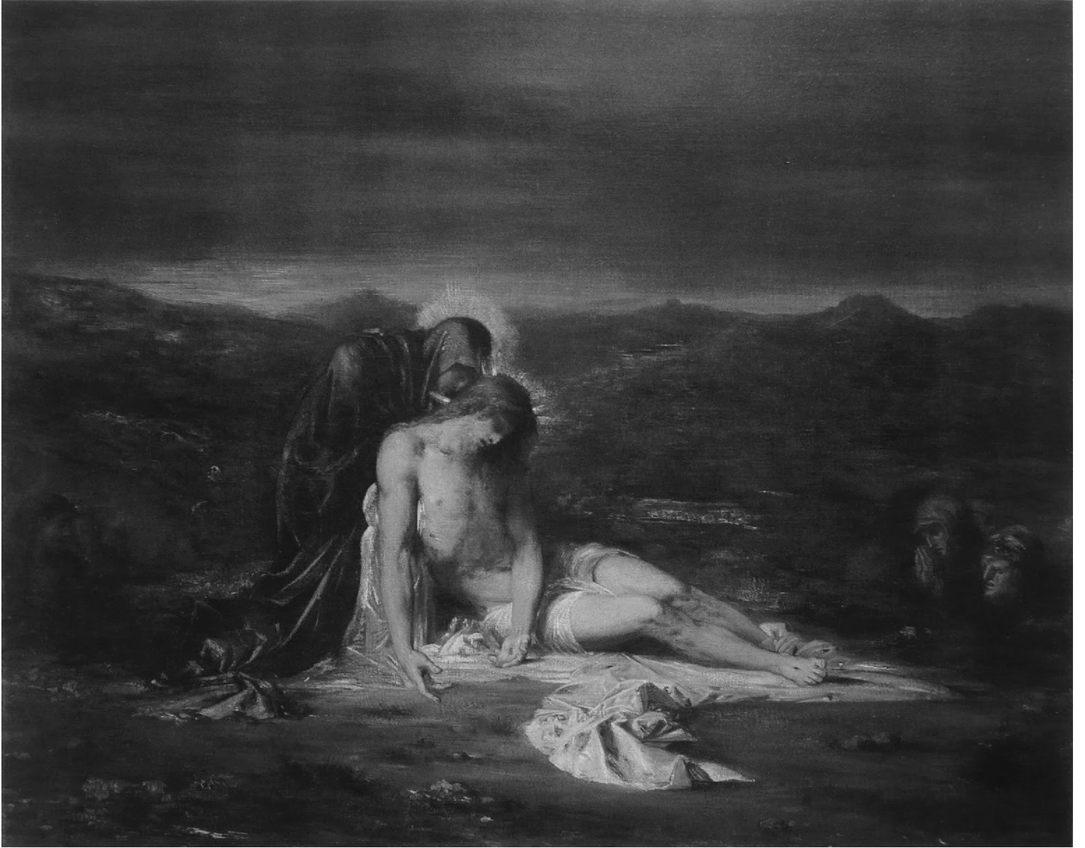
Artwork: Pietà by Gustave Moreau